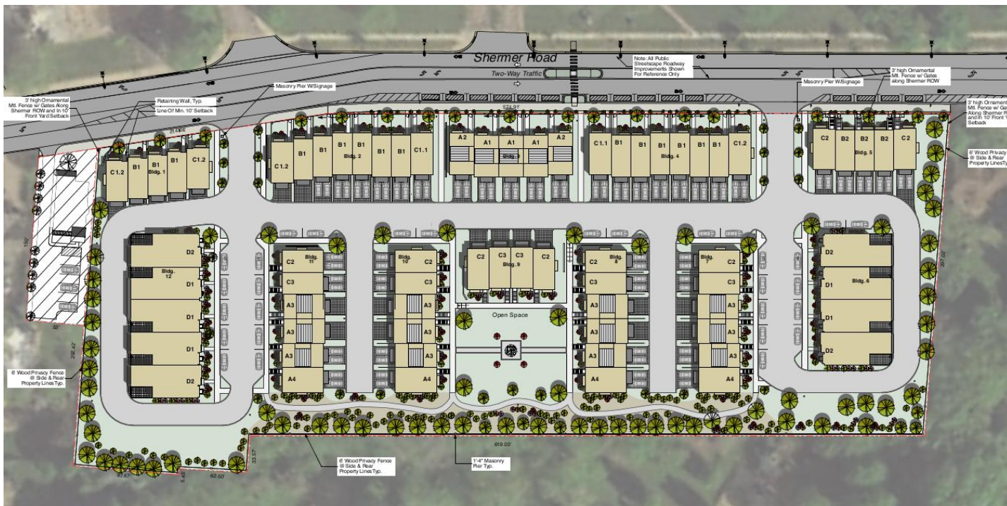
Figure 2: Proposed Development (Illustrative Site Plan)